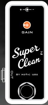
clean solo boost slight boost with pronounced mids