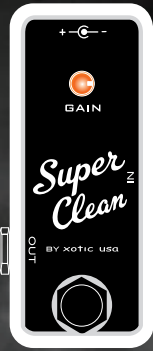
amp overdrive naturally overdriven amp tones