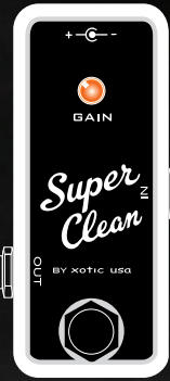
pickup interface equal output for various guitars